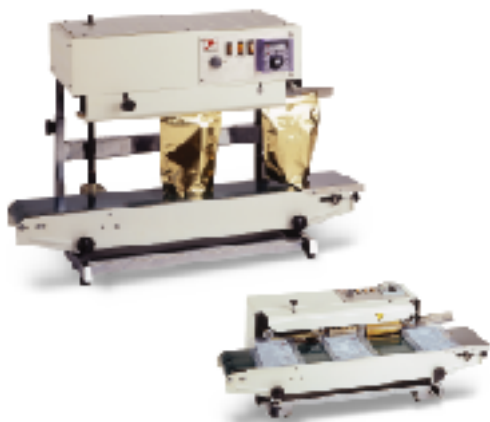
TABLE TOP BAND SEALER